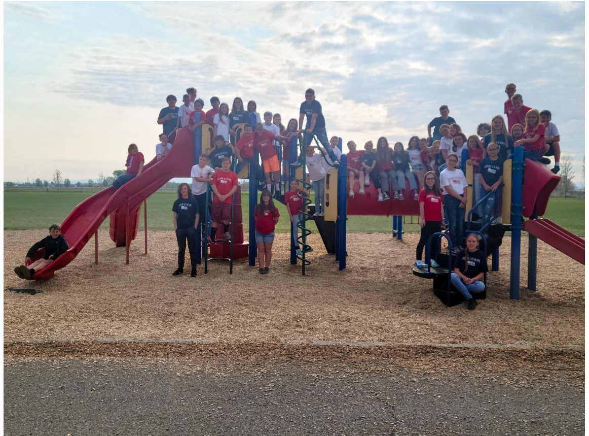
Team Schmaylor 2023