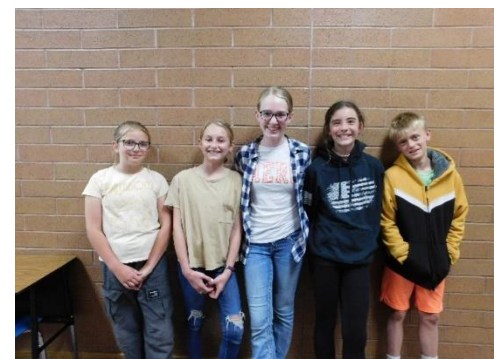
Flag Crew (top) and Office Helpers