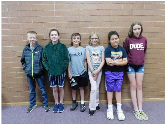
Jefferson Lunch Crew (partial).